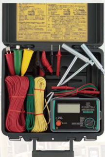
HARDCASE (KEW 4105A-H)